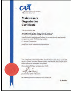
PART 145 Repair Facility for ELT's