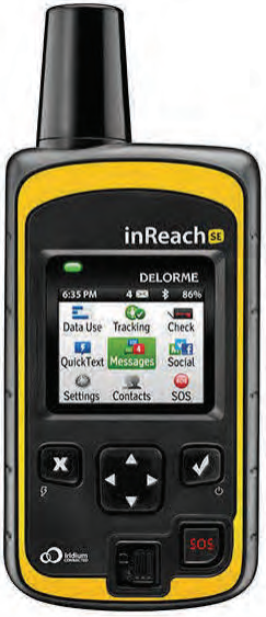
Inreach SE and Explorer AVAILABLE