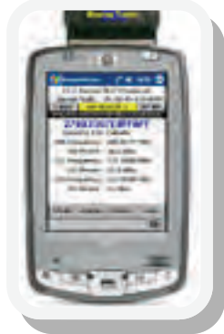
BT100 406MHz Testers ex stock