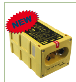
C-S approval comes thru. We anticipate March availability and priced from US909.00+GST

and rescue system, (Cospas-sarsat) that integrates an internal GPS and 406MHz antenna. As a result of this technological breakthrough the INTEGRA offers the international flying community a number of major benefits over the standard ELT models that have been available up until now. It will be available in 406AF, AP and AH versions once the